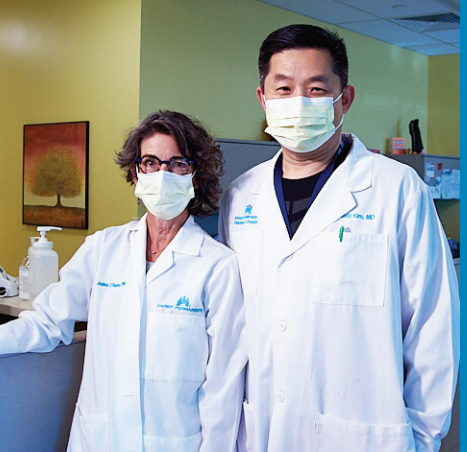
A GUIDE FOR GETTING THE CARE YOU AND YOUR FAMILY NEED